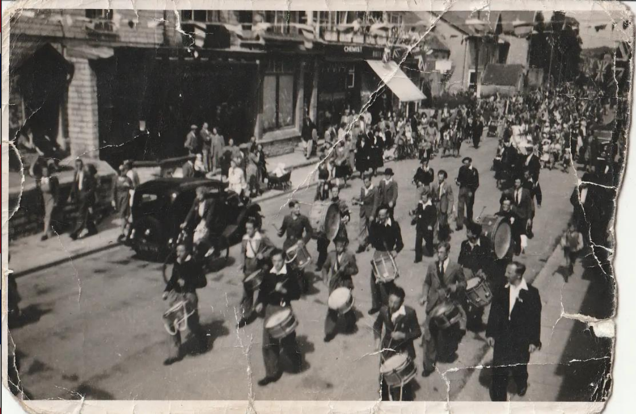
A photo of the "band" marching up the High Street. Ken is behind the big Bass Drum in the middle.